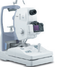
CX-1 Hybrid Digital Mydriatic/Non-Mydriatic Retinal Camera

The non-mydriatic retinal camera is extremely compact and lightweight and uses ultra low flash intensity for more patient comfort and faster examinations.